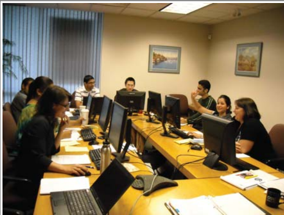
Some of GVC's banking system upgrade team training prior to upgrade weekend

Our banking system upgrade was completed September 12 th through to September 14 th , 2009. Many months of preparation by our conversion team, member patience, and understanding contributed to the relatively smooth transition.