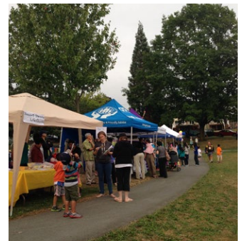
Kingsgate Mall Movie Night