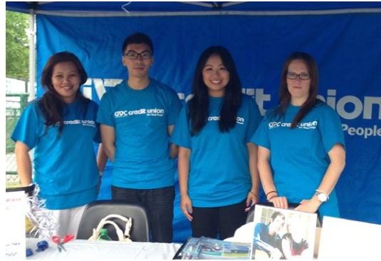
Willingdon Community Fair