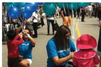
Sapperton Street Festival